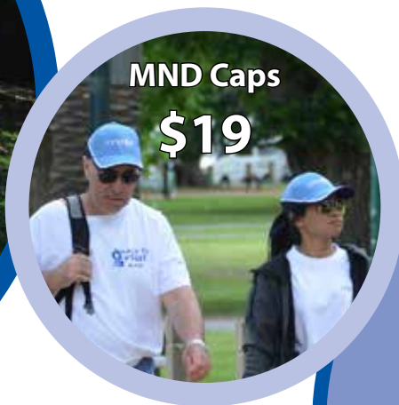
MND Caps $19