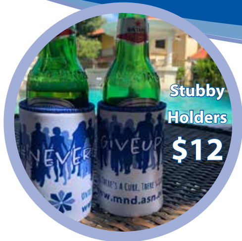
Stubby Holders $12