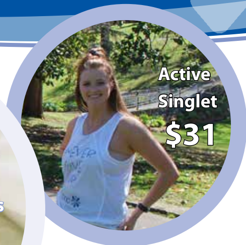
Active Singlet $31