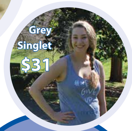
Grey Singlet $31