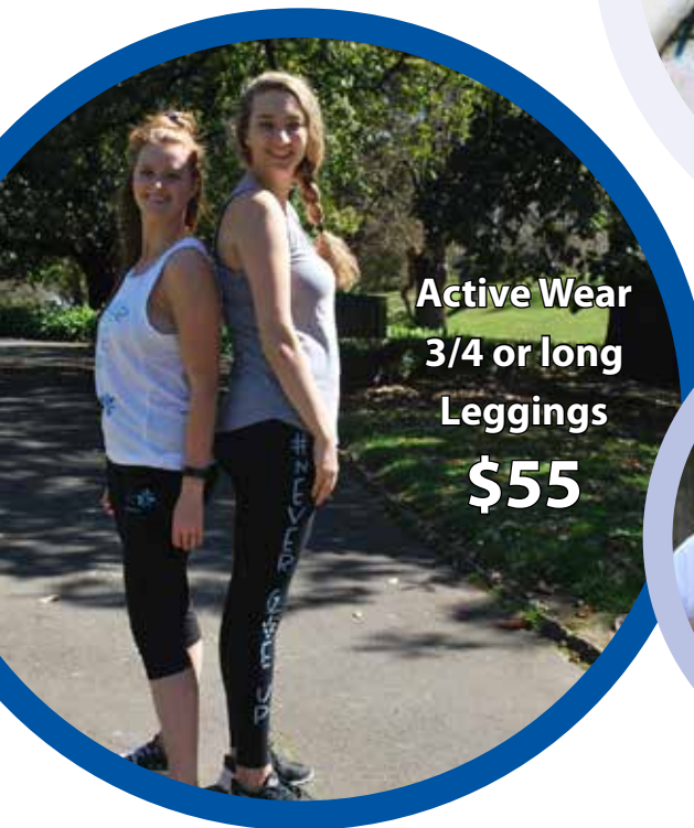
Active Wear 3/4 or long Leggings $55